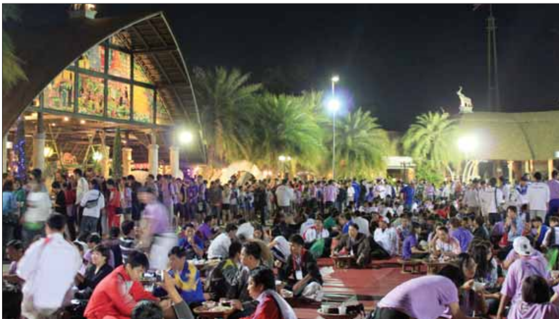
The athletes were given dinner at the Night Safari.