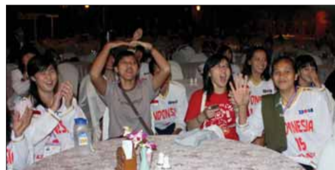
Indonesian athletes have a great time at the evening's entertainment.