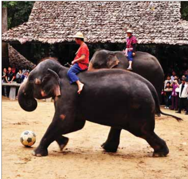
The athletes found the elephants amusing and intelligent with their games and abilities.