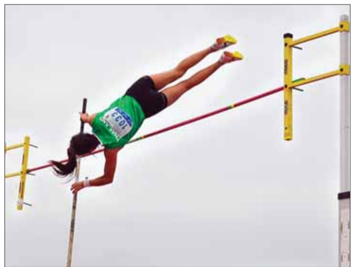
Women's pole vaulters soared high during Saturday's gold medal competition.

While Saturday's Track and Field events are covered on page 3 as it was a very full day for the athletes.