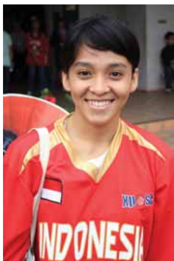
Nelly of Indonesia was interested in buying an umbrella as a souvenir to take home.