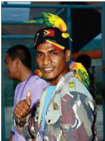
One of the athletes really enjoyed the birds!