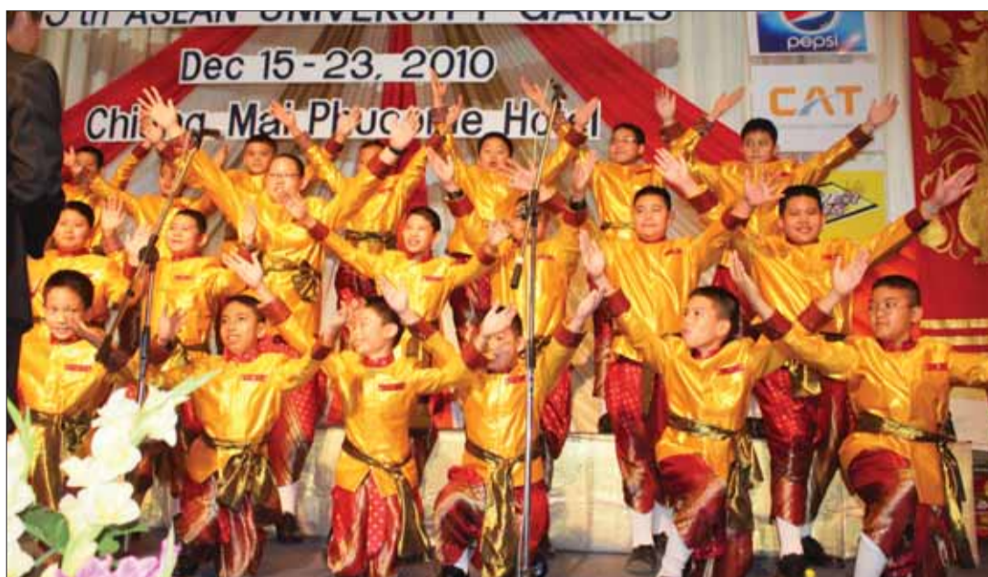
Montfort Boys Choir provide world class entertainment after dinner.

The athletes are given the opportunity to see local entertainers perform at the Chiang Mai Phucome Hotel when boys from Montfort College sing and dancers from perform traditional Lanna dances in costume.