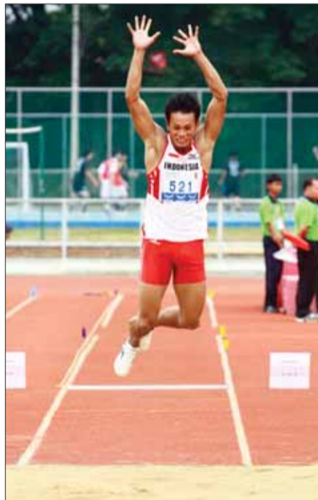
Track and field saw the long jump athletes competing for the gold, see details on page 3.

Athletes, coaches and staff had a rest day today with many taking advantage of the free time to join the organized trips to San Kamphaeng Hot Springs, Mae Sa Elephant Camp, Baan Tawai, Bor Sang and the Night Safari. Pages 4-8 offer a collage of photos of the fun.