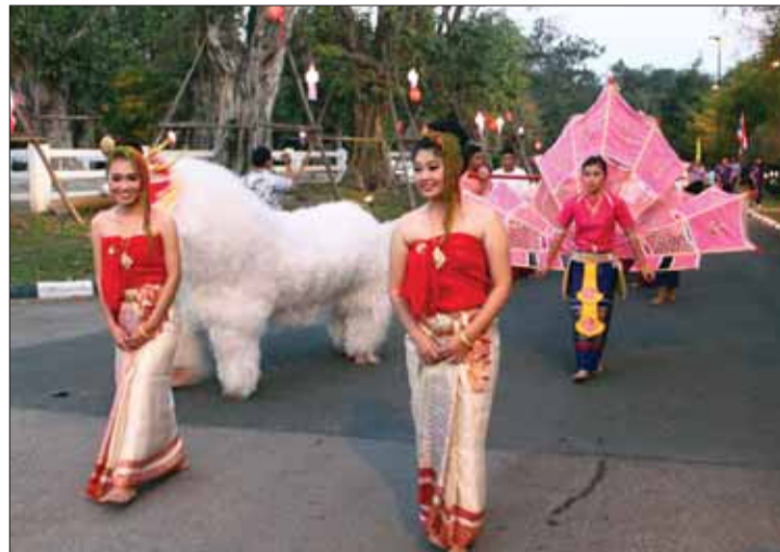
Dancers with a Foon Tou greeted the guests.

a very rarely-found atmosphere and one I never seen like this before. I like the good weather. Apart from these, the food was good and we like the sweet taste specially. It's delicious food. We took a lot of photos with animals up close with them; we are really impressed with this."