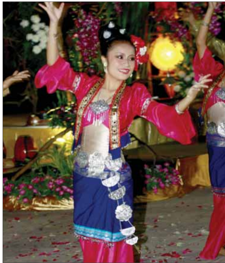
The AUG athletes were welcomed with traditional Lanna dancers.