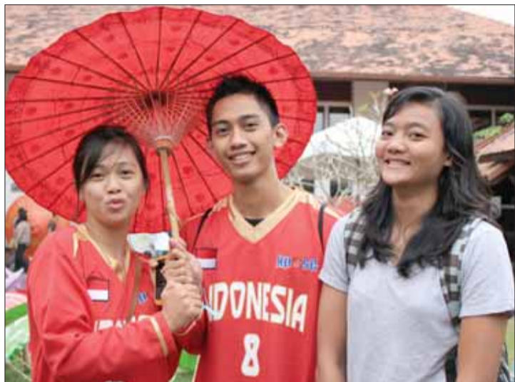
Athletes took turns posing with an umbrella.