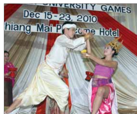
Dancers perform the Bai See Soo Kwan dance to refresh the spirits of the athletes.

So, sit back and be entertained after dinner, and find yourself refreshed and renewed!