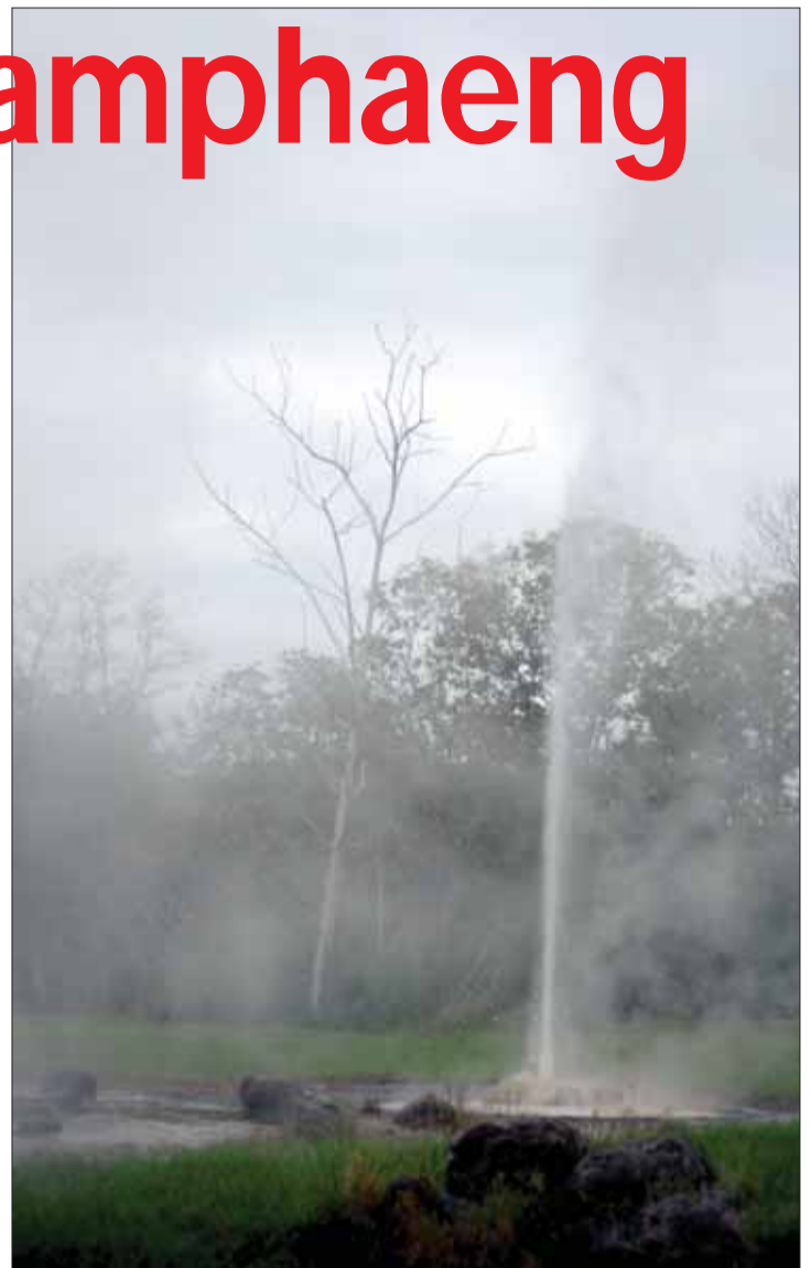
The visitors found the geysers at the hot springs very exciting.

ter and the scenery also. I buy pencils and some souvenirs for my children, my girlfriend and my family. I learn Thai culture like the craft, language and architecture."