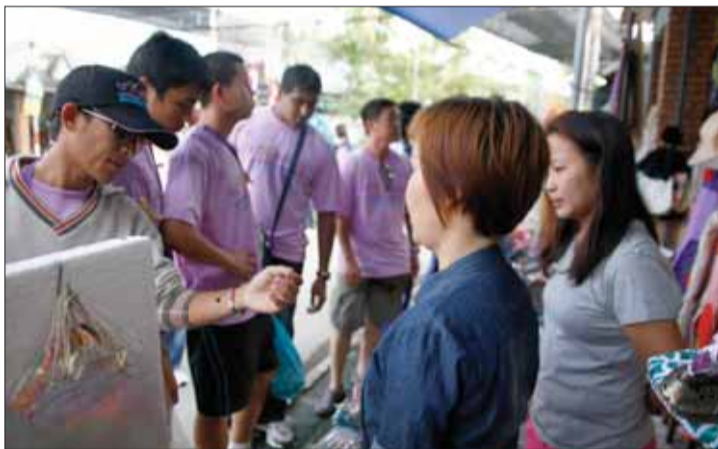
Vendors at Baan Tawai were thrilled to see the students visit.