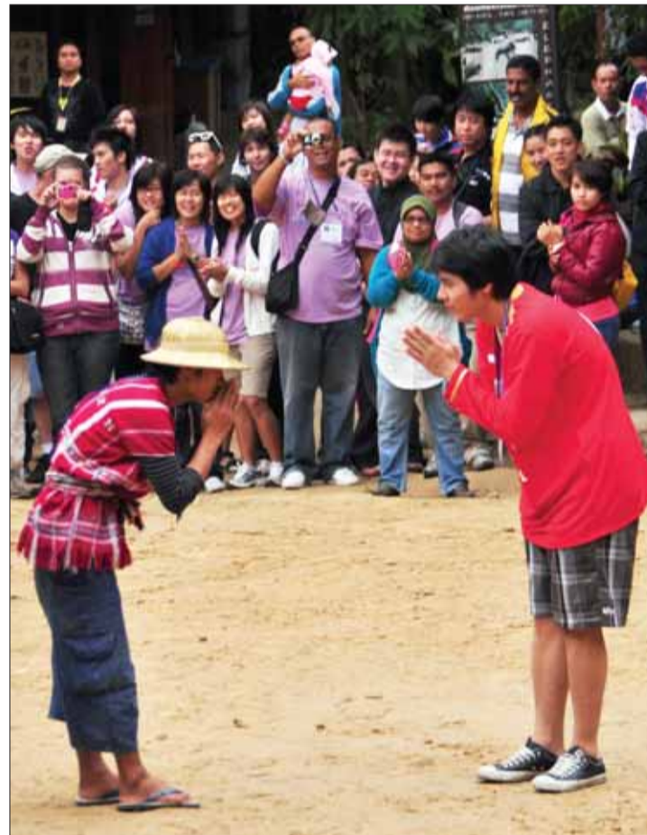
Athletes took part in the elephant show, much to the amusement of their team members.

tain forests, but there is the fascinating show of elephants. I like this kind of weather and atmosphere; I really like the jungle tours. We should also visit Doi