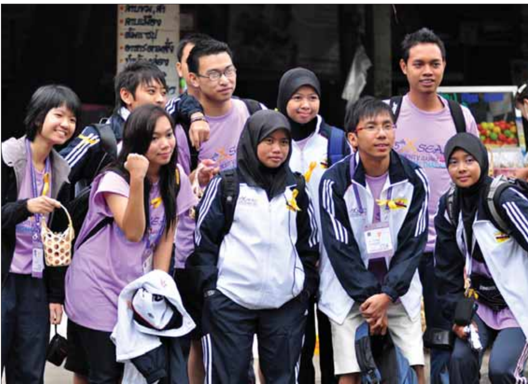
Athletes gathered for photos to show their friends and family back home.