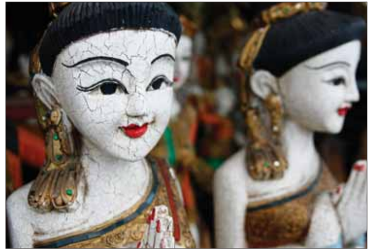
Baan Tawai had many interesting handicrafts for sale.

Posing with the helpful traffic police that made sure their trip around Chiang Mai went smoothly.