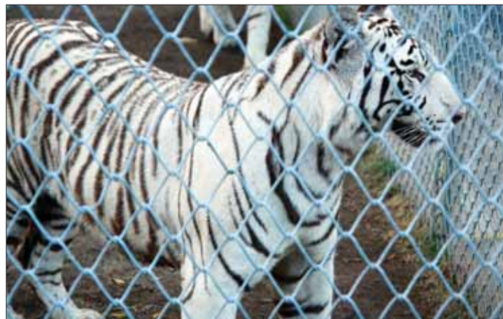
Athletes got to get close to a rare albino tiger at the Night Safari.