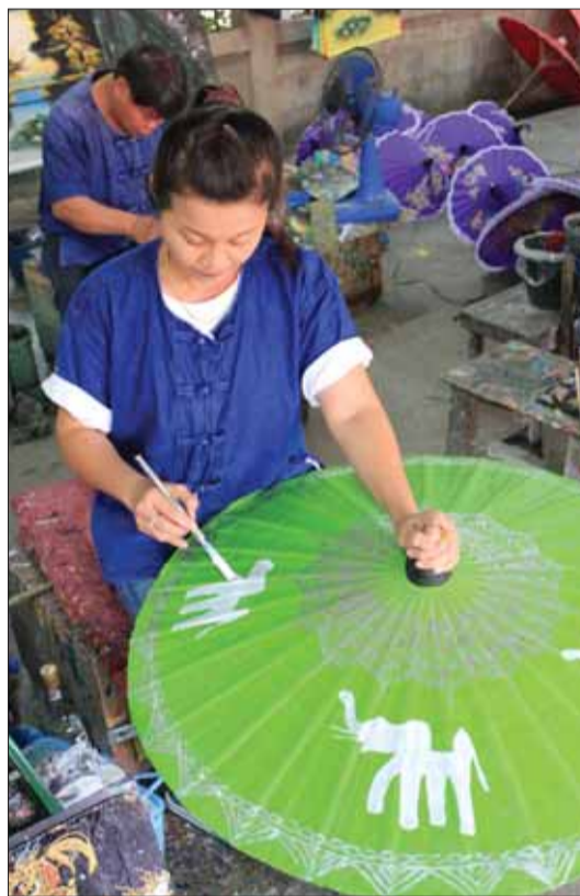
An artist handpaints one of the beautiful Bor Sang umbrellas.