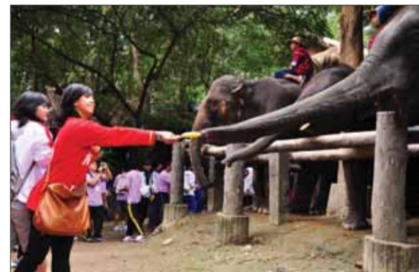
One of the athletes was delighted to find the elephant taking her hat while another fed the elephants sugar cane.