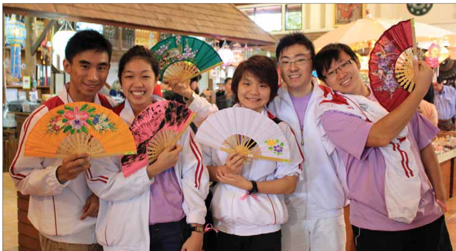
Athletes pose for a group photo.