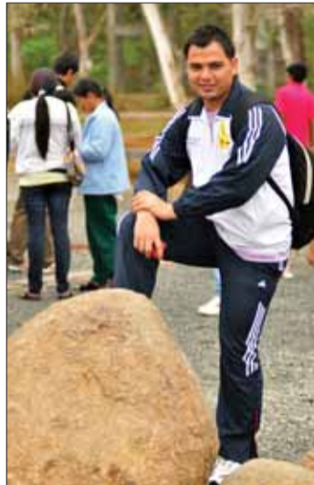
Students enjoyed the cool temps and beautiful scenery.

Silat player from Brunei said, "I am excited to go to these hot springs because we don't have one in our country. I feel very happy to take a lot of pictures and boil eggs, and put my feet in the water. In Brunei, they don't have such a weather like this it's very cold and the scenery is very beautiful also so are the girls."