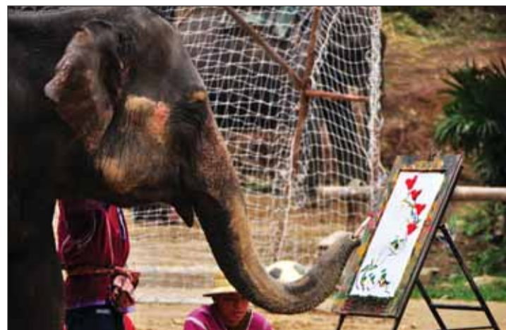
The elephant painting was a big hit with the crowd.