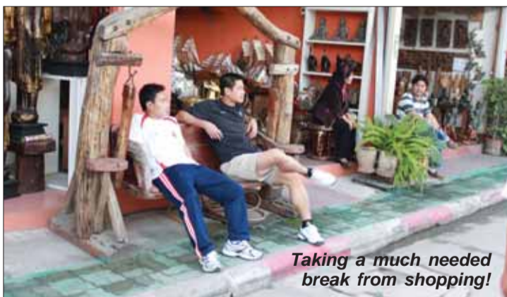
Taking a much needed break from shopping!