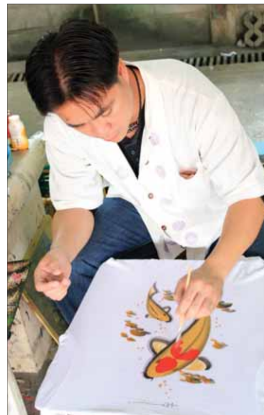
One of the artisans hand painting on silk.