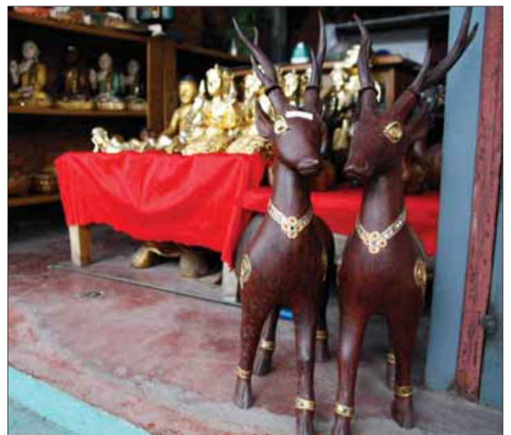
More handicrafts on offer at Baan Tawai.