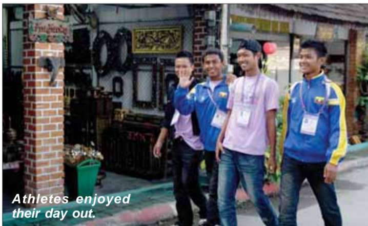
Athletes enjoyed their day out.