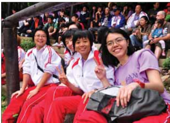
The visitors really enjoyed the elephant show.

Story By Chutimon Saowapha