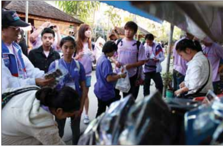
The visitors hoped to stock up on souvenirs for their families.