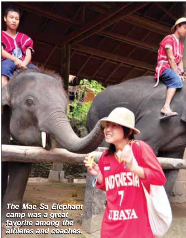
The Mae Sa Elephant camp was a great favorite among the athletes and coaches.