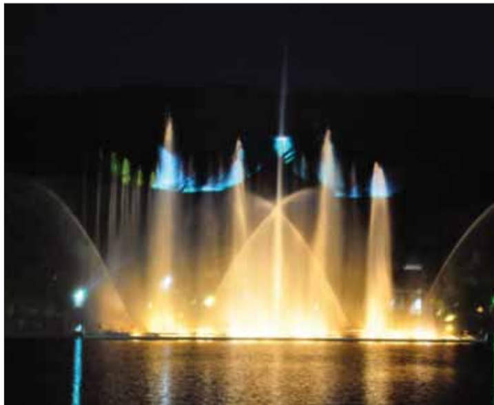
The sound and light show over the water wowed the guests at night.